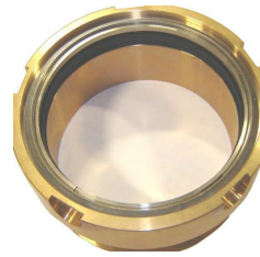
Custom Metallic Scraper