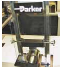
High Strength Micro-Alloy Steel

A combination of technologies designed to provide extended service life in the toughest of environments.